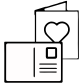
Greeting cards & Postcards